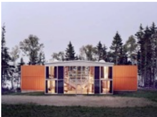
12 Containers - 1 Amazing Home