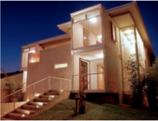
A 3,200-square-foot home. Redondo Beach, CA.