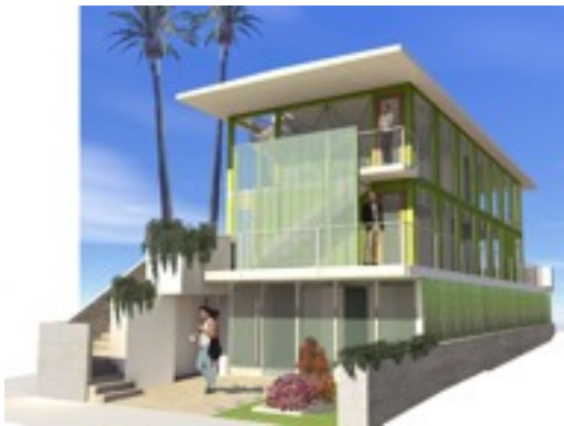
Two-apartment complex model