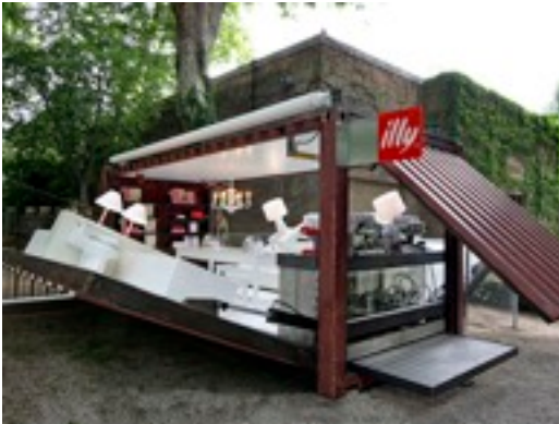
The Illy Coffee Stand. Venice, Italy