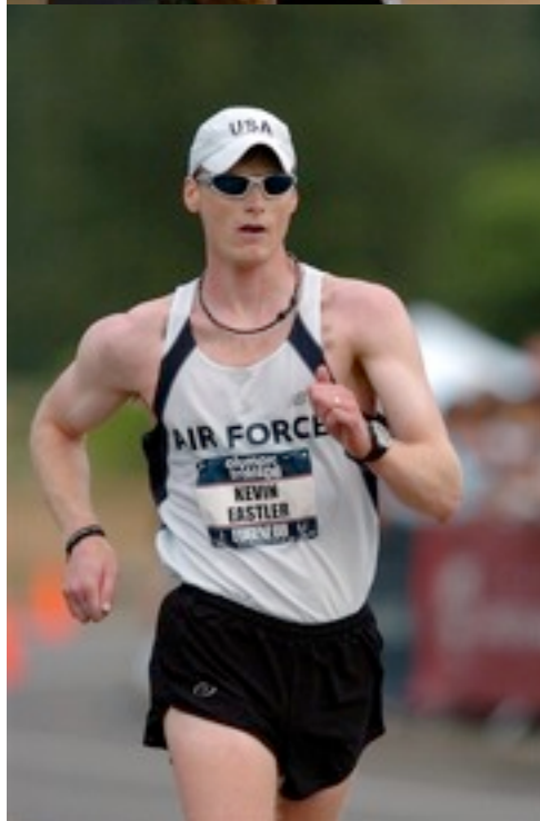
TOP: Lones W. Wigger Jr., narrator for 2008 Olympic games coverage for MSNBC.