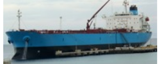
M/T MARCO - to be MAERSK MICHIGAN