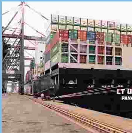
Photos: Eurogate Terminal in Bremerhaven

containers bound for Florida through Eurogate terminals in Bremerhaven. Quehenberger Logistics Group will monitor the containers throughout the transport chain. European participants in the project also include: ASTRUM; Eurogate; and EDC (European Datacomm). EADS assumed project coordination with support of the Government of the Federal State of Bremen, Germany. The only other US firm involved in the project is Florida Stevedoring, Inc.; It will provide administrative support for the containers scheduled to arrive at Port Everglades, Florida.