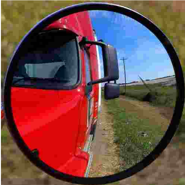
The road ahead - Trucking Industry See page 2

wishing HAPPY HOLIDAYS to NDTA members & friends