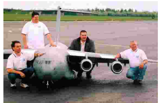
Creators of the C-17 Globemaster model

thrust of 108 lbs. It weighs over 250 lbs fuelled, and carries 12.5 liters (3.3 US gallons) of 95% kerosene and 5% turbine oil fuel. Other details include 5 Futaba PCM receivers, 16 battery packs (93 cells), 20 Futaba servos, on board air compressor and electro/pneumatic retracts. Wingspan is 20 feet 8 inches, and the top of the fin is 74 inches (6 feet 2 inches) above the ground. Takeoff weight is 264 lbs. The rear cargo doors open and they drop an r/c jeep on a pallet, as well as 2 freefall r/c